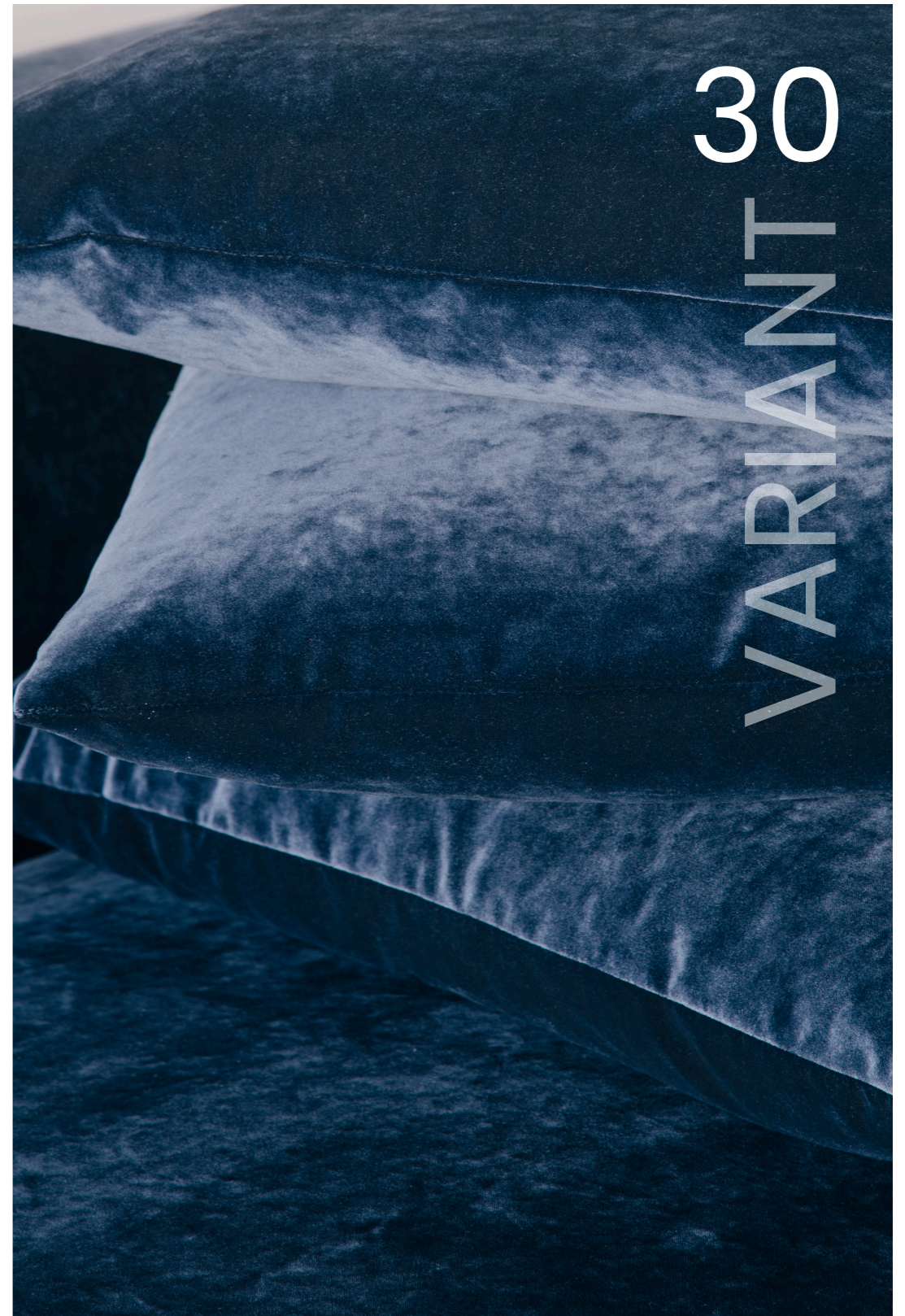
Roma, the touch of rough luxury by tradition. Shadows of New age luxury